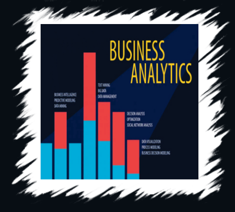
BUSINESS ANALYTICS & INTELLIGENCE MANAGEMENT