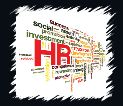
HUMAN RESOURCE MANAGEMENT

Our major aspect of introducing the MBA programmed is to provide highly Skilled, well trained and employable professionals to the industry equipped with Latest knowledge and technology as per the requirement of the industries. The Curriculum has been designed to help the learners to become not only employable But also encourage them to become dynamic entrepreneurship. Our MBA specializations provide in-depth understanding and covers national as well As global issues.