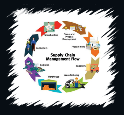
SUPPLY CHAIN MANAGEMENT