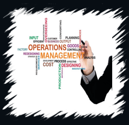
OPERATION & PRODUCTION MANAGEMENT