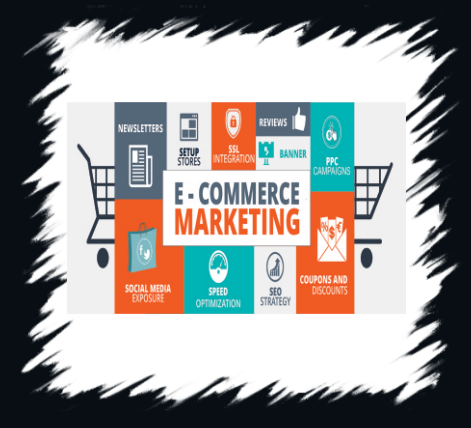
E-COMMERCE MARKETING & MANAGEMENT