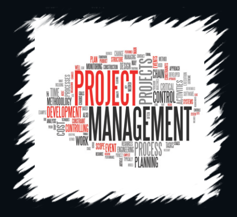
PROJECT LEADRESHIP MANAGEMENT