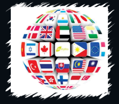
FOREIGN TRADE & GLOBAL BUSINESS MANAGEMENT